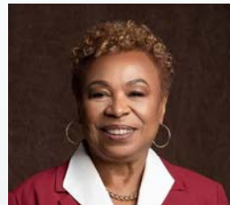
The Honorable Barbara Lee