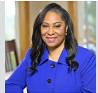
Congresswoman Janelle Bynum 5th Congressional District Oregon