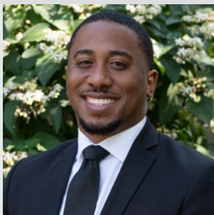
Vince Jones-Dixon Multnomah County Commissioner District 4