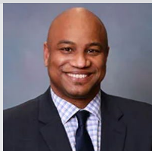
Mayor Travis Stovall Mayor City of Gresham