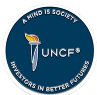
Investors in Better Futures $1,000 - $4,999