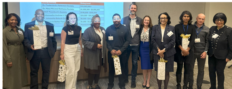
UNCF Seattle AMI - Investors in Better Futures Members.