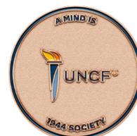
1944 Society Planned gifts