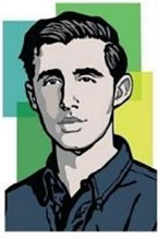
THE ANDREW GOODMAN FOUNDATION