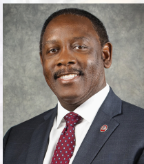
The Honorable Jerry Demings Mayor, Orange County