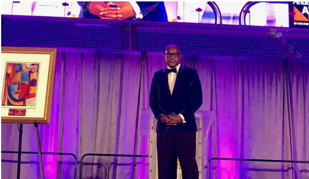
PRESENTING AT MINNEAPOLIS MASKED BALL AWARD CEREMONY