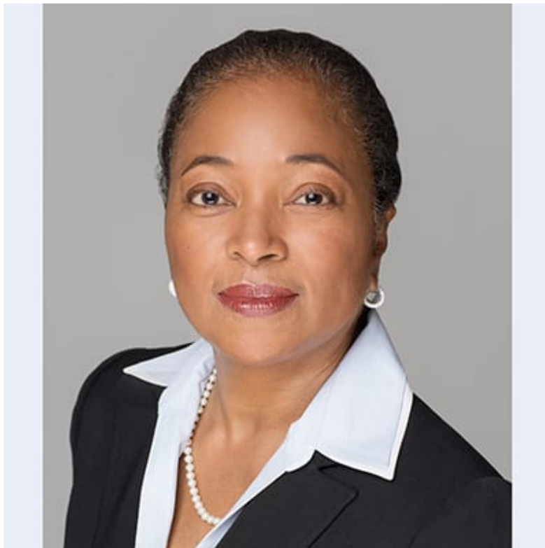
President and CEO The Dominion Asset Group UNCF Board of Directors