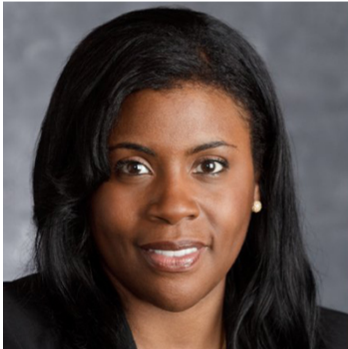
Executive Vice President and Chief Information Officer Wells Fargo & Company UNCF Board of Directors