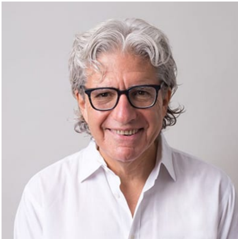
Senior Advisor WPP UNCF Board of Directors