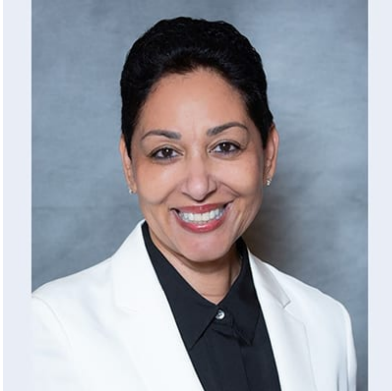
Vice President, Global Diversity, Inclusion and Belonging NetApp UNCF Board of Directors