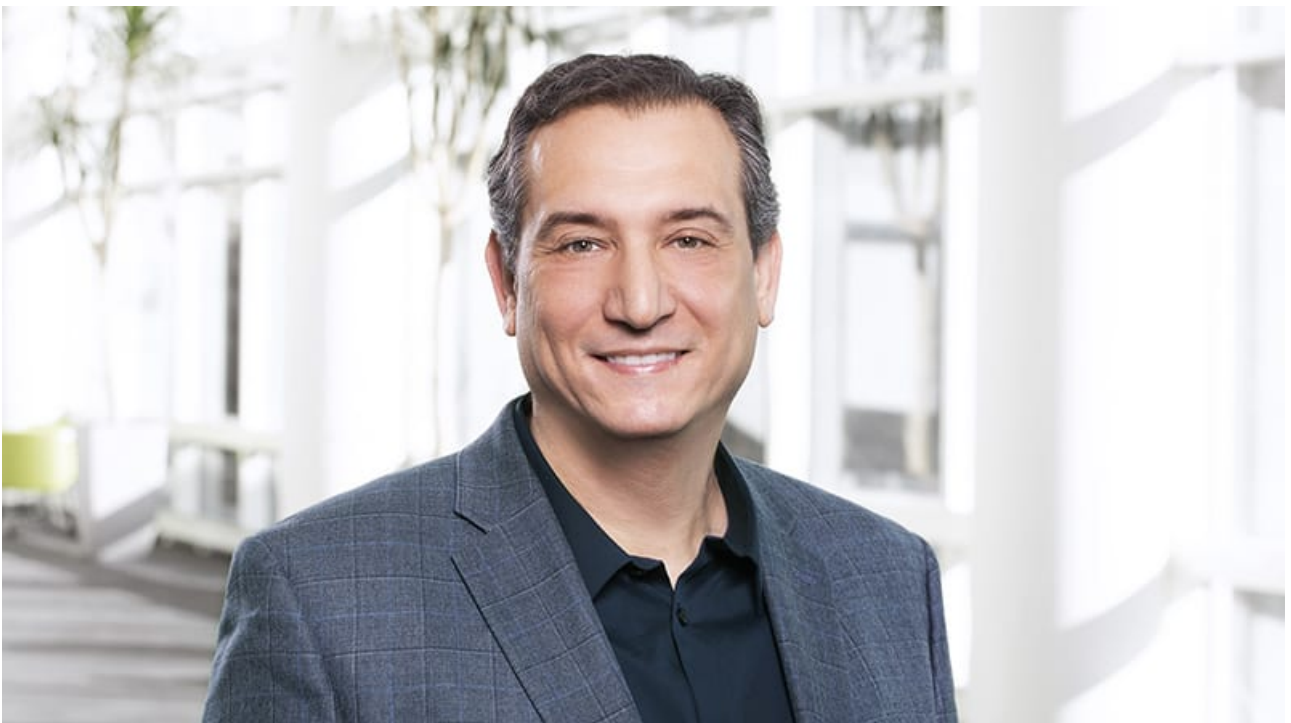
President, Personal Health Care Procter & Gamble Co. UNCF Board of Directors