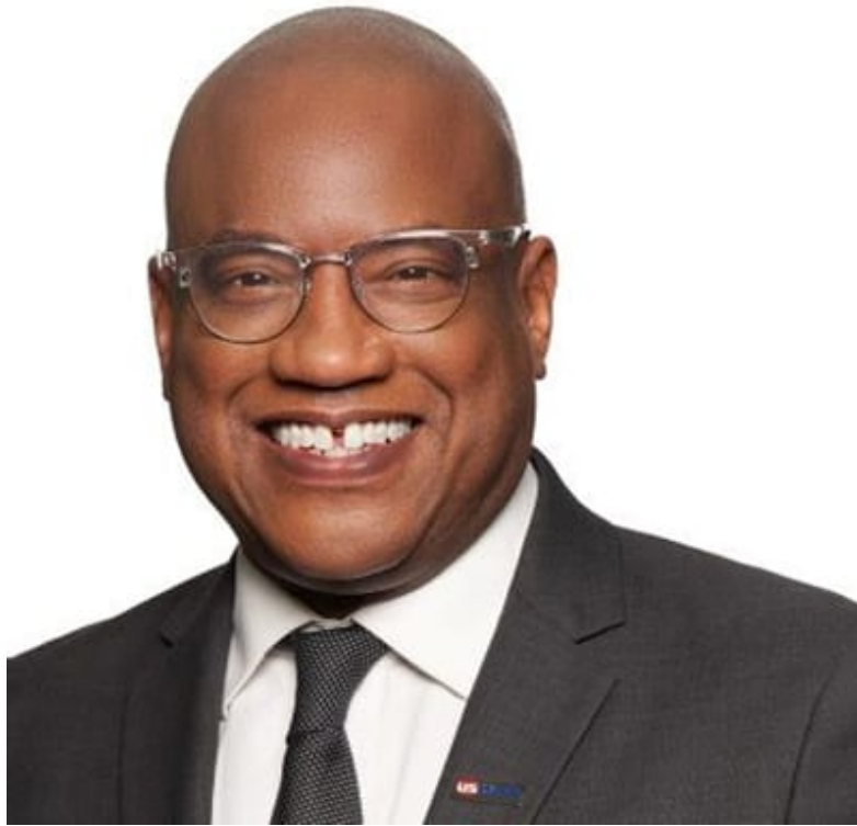
Vice President, Enterprise Diversity and Inclusion U.S. Bancorp UNCF Board of Directors